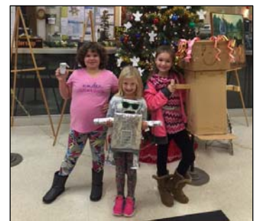
2 nd grade made robots

The Tidioute Community Charter School second grade read a story about a science fair and all of the projects that the students were doing. They needed to co-operate and work together to get it done as a team. As an extension of this story we made, or drew a picture of a robot, presented it, and told what it did to help out.