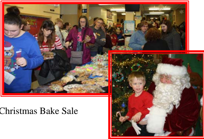
Christmas Bake Sale

PTO put on a Santa' Workshop for the students in December. Santa visited TCCS.