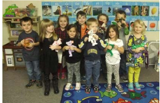
PHOTO: K4 AND K5 STUDENTS.